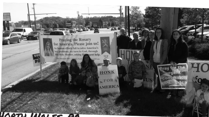
NORTH WALES, PA