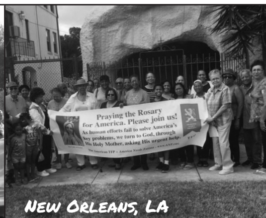
NEW ORLEANS, LA